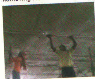
Merging slurry after de-shuttering